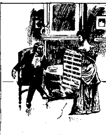
UNCLE SAM'S THANKSGIVING BILL OF FARE. The illustration shows Uncle Sam in a festive setting, seated at a table with a turkey, holding a large document labeled 'BILL OF FARE'.