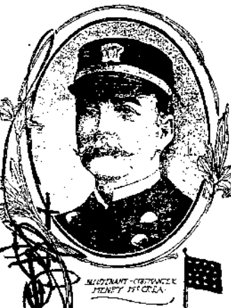
UNCLE SAM'S RESTRAINING HAND AT COLON. The Uncle Sam character is shown in a traditional, somewhat grumpy expression, wearing his iconic top hat and holding a cane.